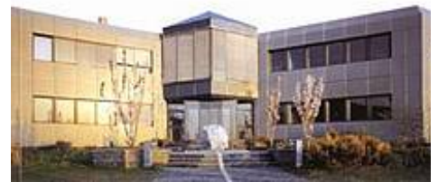
Alarmproof company building